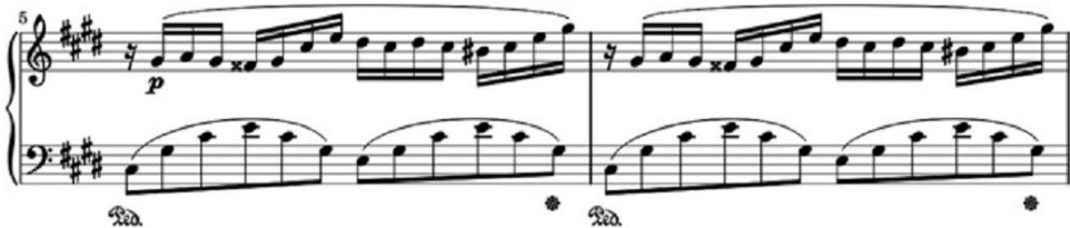
Figure 5. (F. F. Chopin, (1834) Fantaisie Impromptu in C-sharp minor Op. 66. Bars 5-6.)

Impromptu. The fun play on Chopin's name adds another humorous level: Chop-in and the 'chopping' of the text dialogue. The piece is also another example of using two different rhythms or polyrhythm. The right-hand is playing sixteenth note semiquavers against sextuplet quavers in the left-hand. Basically, one hand fills the gaps between the notes of the other which represents how Emmy is unable to take part in the conversation.