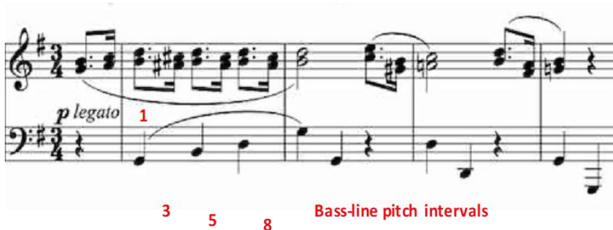
Figure 3. (L. van Beethoven (1796) Minuet in G, No. 2. Opening four-bar phrase right and left hands.)

In Figure 3, the red numbers I have marked-up in the bassline show the pitch intervals from the first note (G) to the second (B) is a third, and to the third (D) is a fifth, and to the fourth (G) is an eighth (G) i.e. 3, 5, 8. The locker number Emmy is trying to find is 538. This is no accident. Lucido (2019) is remixing the note order of the arpeggio. When the key to this code is cracked it may (for some readers) involuntarily trigger the sound of the pitch intervals of the locker (D, B, G). The notated slur reaching over the four notes means they are to be played without separation which locks them together. The tonic (1) is not required as it forms part of the Minuet title. Playing with sound in the text continues with the locker code combination: 12 clockwise, 32 counterclockwise, 8 clockwise and then Emmy is 'stuck' (Lucido, 2019:8). She has forgotten the fourth part of the sequence. Three out of the four-part sequence is stated. This is again stressing the repetitive play with the time-signature